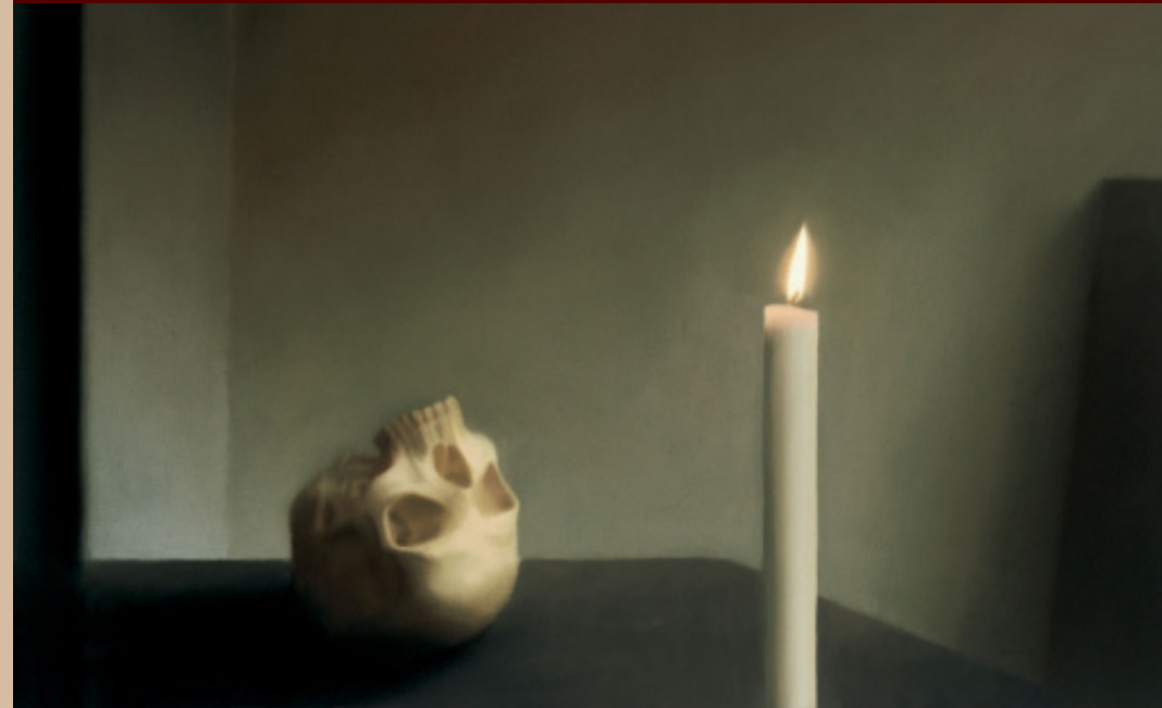
Skull with Candle, Gerhard Richter